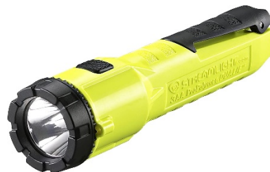
Streamlight 140-Lumen Dual Function Flashlight